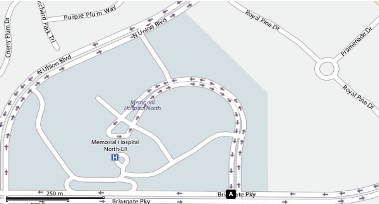
MEMORIAL HOSPITAL NORTH 4050 BRIARGATE PARKWAY